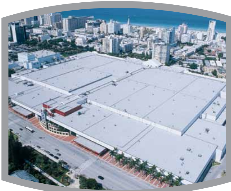
Miami Beach Convention Center and Jackie Gleason Theater of the Performing Arts— 873,000 square feet of Firestone 2-ply SBS system.